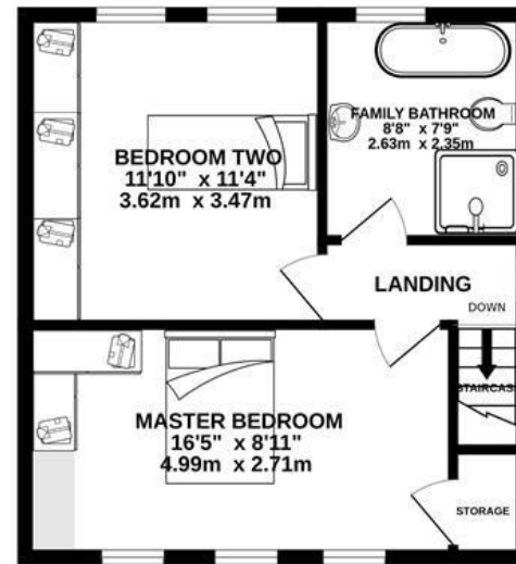
1ST FLOOR 396 sq.ft. (36.8 sq.m.) approx.